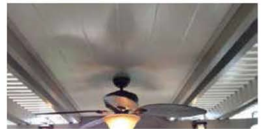
OPTIONAL PLANKING FEATURE.

Elitewood™'s insulated patio covers come with a limited lifetime warranty. Enjoy your new outdoor retreat, not worry about it.